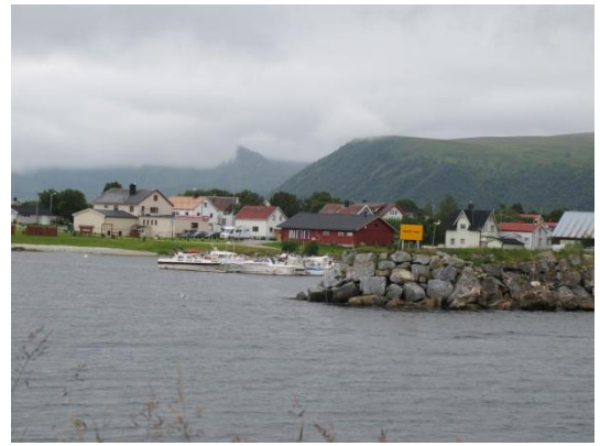
In Dverberg we parked outside Coop at "COOP A KABANA BEACH".