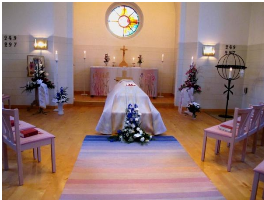
Grand Grandma Helga passed away on 26 October.