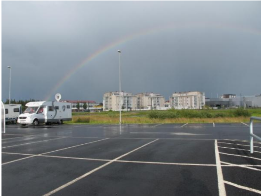
On our way from Andøya we made a stop in Haparanda. Here we saw the proof of the treasure being placed at the end of the rainbow!