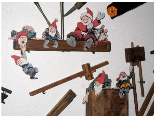
These are some of our gnome pictures from the past that we found. They are made to hang on things on the wall.

With these nostalgic gnomes we wish you all: