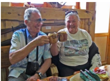
Coffee break at the Wild life Museum.