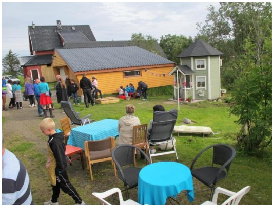
During August we visited a Moomin house in Dverberg on the island of Andøya in Norway