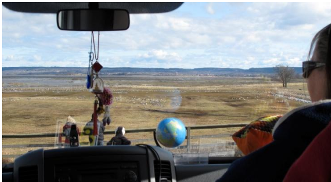
During spring we saw the cranes dancing around the lake Hornborgarsjön. Fantastic scenery with a top record of cranes just outside our Mobile home front window!