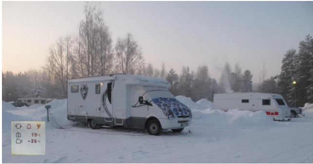
The year started very cold! Especially when we went to Jokkmokk's winter market in February. Minus 36-38°C!